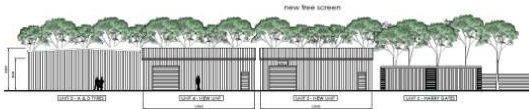
Road Elevation scale 1:100 @ A1